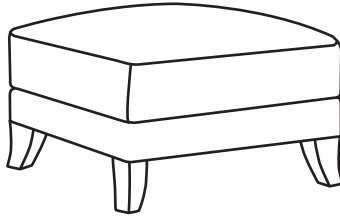
30-176 - Ottoman 28 x 20 x 19 Matches lounge chair 30-175