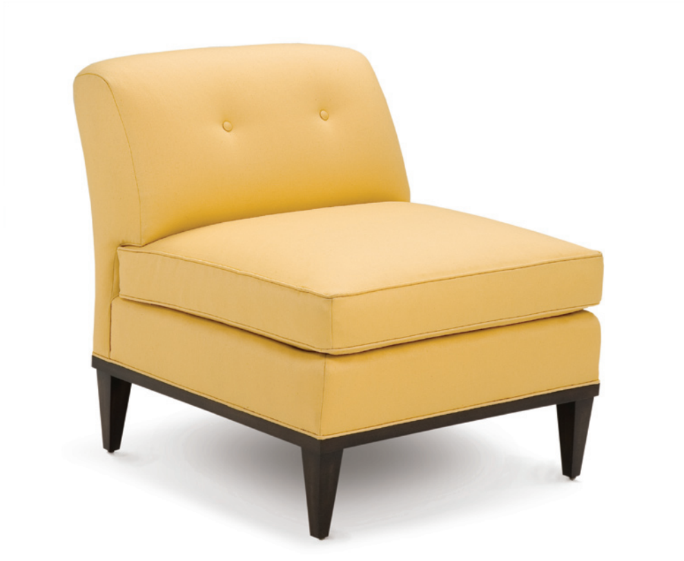
AVALON Slipper Chair